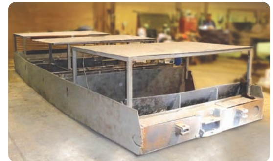
Personnel carrier in rebuild stage